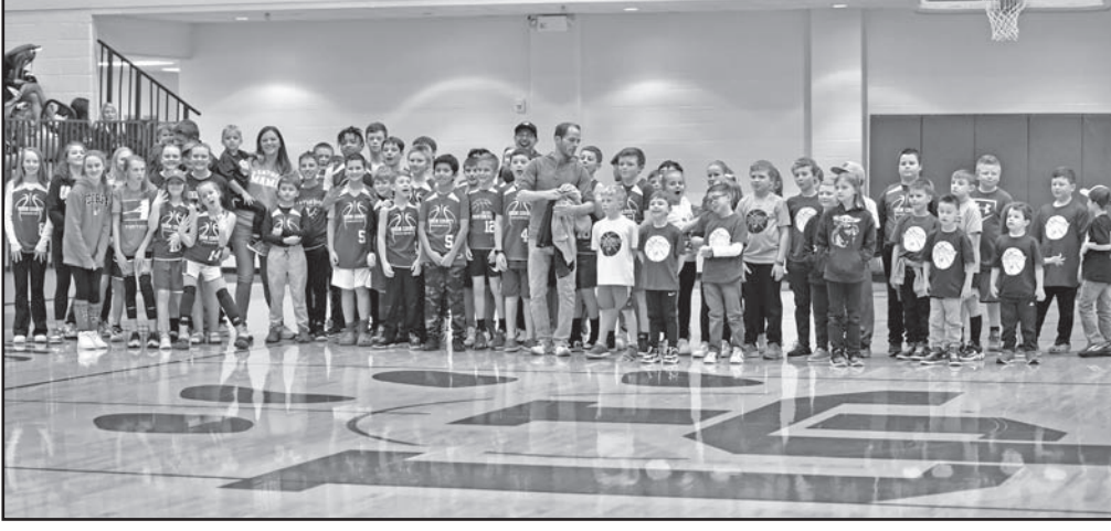
The Union County Rec Department youth teams were recognized last Tuesday, Jan. 10.